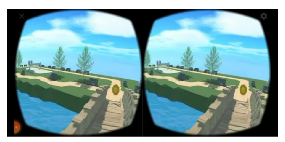
Figure 2. Virtual Environment of SenMor-VR

If the user selects the "play" button then they will enter into an interactive virtual environment. Users are expected to be able to pass the existing road according to virtual conditions to the finish line. In this case, balance, coordination, and accuracy-related to sensory and motor are needed (figure 2).