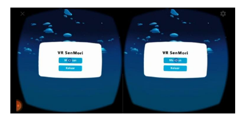
Figure 1. Frontpage of SenMor-VR

If the user selects the "play" button then they will enter into an interactive virtual environment. Users are expected to be able to pass the existing road according to virtual conditions to the finish line. In this case, balance, coordination, and accuracy-related to sensory and motor are needed (figure 2).